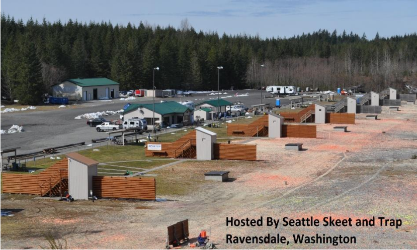
Hosted By Seattle Skeet and Trap Ravensdale, Washington