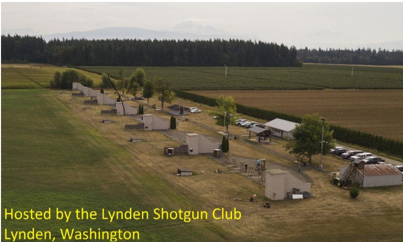
Hosted by the Lynden Shotgun Club Lynden, Washington